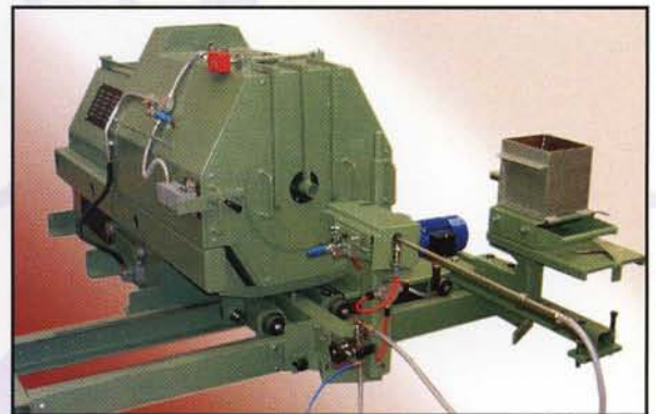
AU1 C/W Auto Spray System